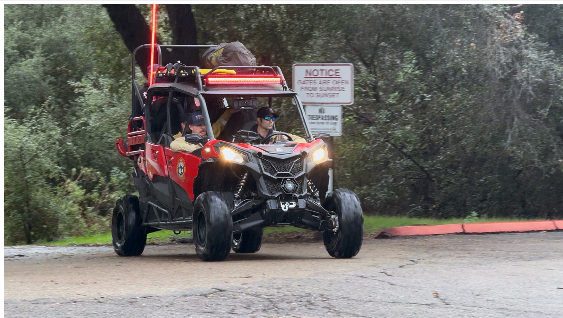
First responders on scene to rescue a woman swept away from floodwater near Lake Hodges.