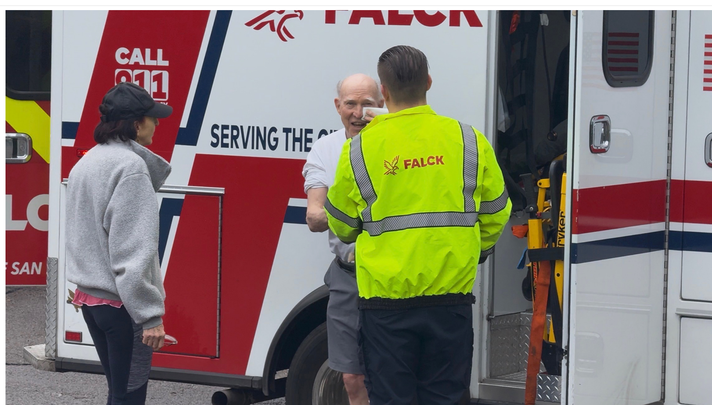
A local man whose wife was rescued New Year's Day from rushing waters near Lake Hodges.

January 1, 2026, at about 8:10 a.m., deputies from the San Marcos Sheriff's Station were dispatched to a water emergency near Lake Hodges in unincorporated Escondido.