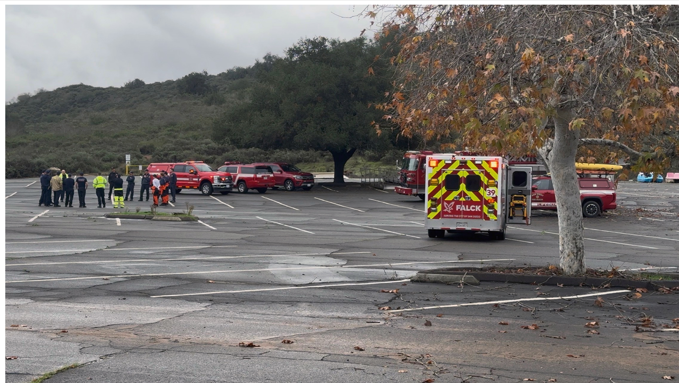
Rescuers at New Year's Days action near Lake Hodges.

The Sheriff's Office urges the public to never walk, swim, or drive through flooded areas and use caution when entering an area prone to flooding. Just six inches of fast-moving water is enough to put your life at risk. Remember, turn around, don't drown.