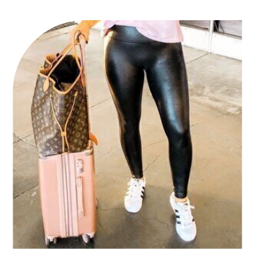
Stop Dressing Like This At The Airport, We're Begging You