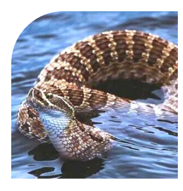
Taking A Dip In This US Lake Could Be Your Final Mistake