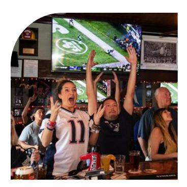
The Best Bars In Europe Where You Can Watch US Football