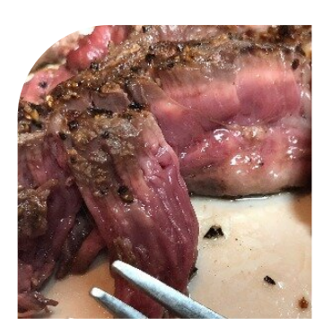
The Nasty Steakhouse Chain You Should Avoid At All Costs